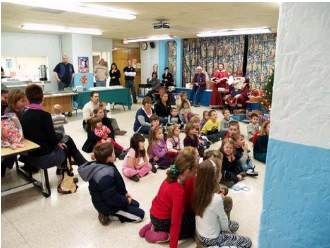
The children were entranced by the magic show at the party.