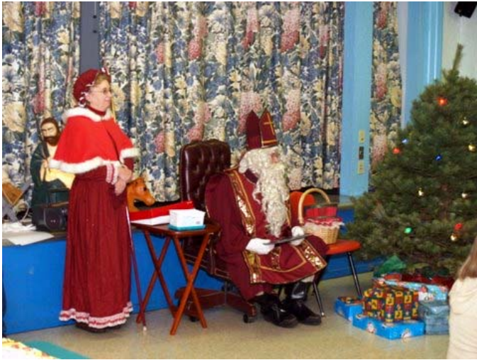
St. Nicholas was on hand to help the children celebrate the holiday spirit. Songs were song and the kids had a great time.

This year our council put on a Christmas party for the children of the council that included all kinds of events and activities. Santa, St. Nicholas, a magician, and a caroling sing along kept the children smiling all day long. Not only did the kids and adults have a great time, but local families benefited from the gifts donated by all the children in attendance. Thank you again to all that contributed. Words can't express our thanks enough for the joy and lasting memories shared at the event. Our website contains additional pictures from the event.